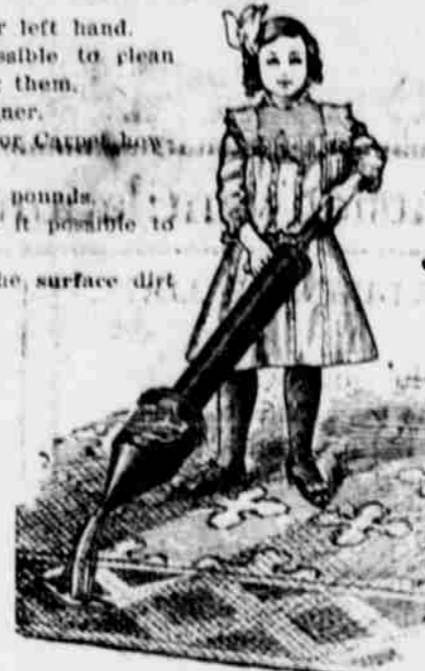
PHONE PACIFIC 6521, HOME 135-R

Because it will save Time, Labor, Rugs, Carpets, Furniture and Draperies. It removes all the Germ-Laden Dust. It protects your Health, and it means longer Life. It means the same to the home as the bath tub means to you. Takes all of the germ-laden dust out of the home forever.