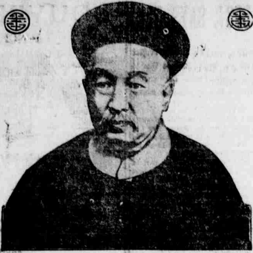
HIS EXCELLENCY SHENG-SUAN-HUAI

PEKIN, May 27.—"When things look darkest, the man appears." So runs the Chinese proverb. For two years and more China has been in a condition of drift. Ever since death tore the reins of government from the firm grasp of the old empress dowager the end and aim of Chinese officialdom has been to avoid assuming responsibility. If the result has not been chance, it has been a condition almost as dangerous and quite as unsatisfactory. The ship of state has been drifting about rudderless, at times perilously close to the rocks. In the opinion of many Chinese, a crisis is near at hand.