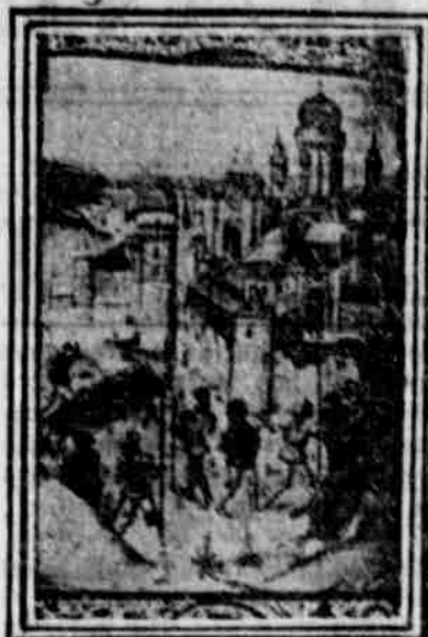
ILLUSTRATION FROM THE PEMBROKE BOOK OF HOURS