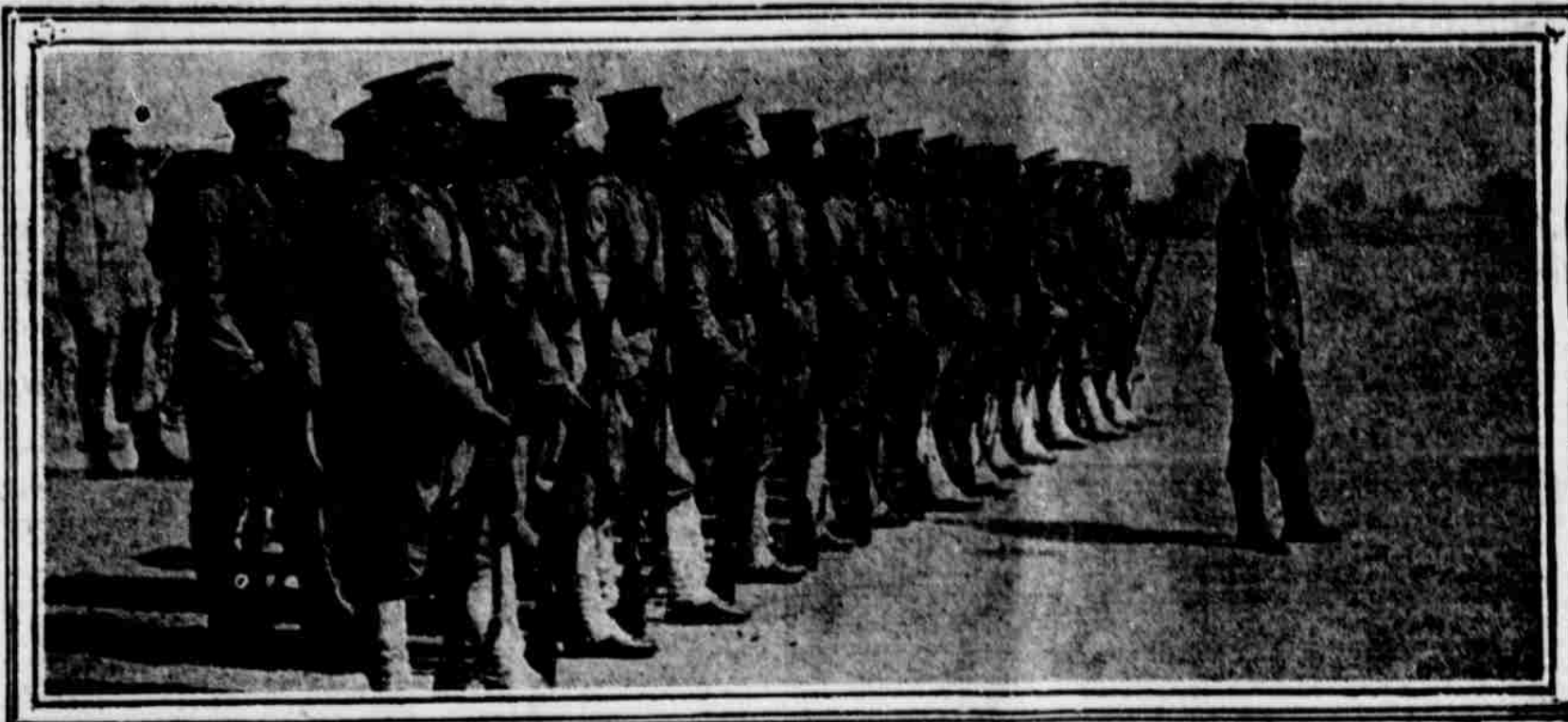
DRILLING CHINESE SOLDIERS AT PAO-TING-FU.

An edict recently issued to the Chinese army by the minister of war, reminding them that military efficiency is China's only means of maintaining national and domestic security, seems to show that the Middle Kingdom is beginning to grasp the true inwardness of western civilization and that Ciesial projection against soldiers has given way to other ideas. China has now two armies, one numbering some five hundred thousand, that is ancient and inefficient, and another consisting of one hundred and sixty thousand well trained, effective men, schooled in up to date warfare and officered by men who have studied in military colleges abroad. These troops are armed with modern rifles and rapid fire artillery.