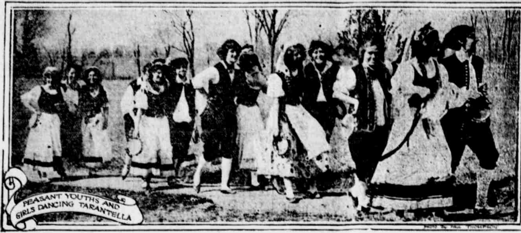
POUGHKEEPSIE, N. Y., May 13.—A resplendent and colorful spectacle that filled and held the eye delighted hundreds of spectators, when the students of Vassar college observed the fiftieth anniversary of the founding of the institution by open air exercises on the college grounds, consisting in the main of pageant and dances and songs. If there is any spot on the exploratory globe which poses a folk dance that was not shown time in the program the spot itself must have been to blame in not sending its specifications beforehand. From the stroke of noon until the shadows of afternoon lengthened, good looking girls clad in a rainbow of brilliant costumes awayed before the beholder like a living garden.