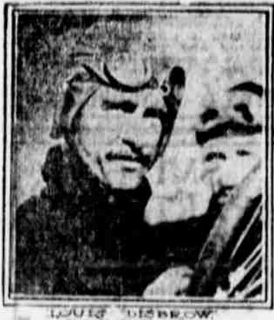
Diabrow will pilot a Buick-Morford car in the great mile auto race on the Indianapolis Motor course on Memorial Day.