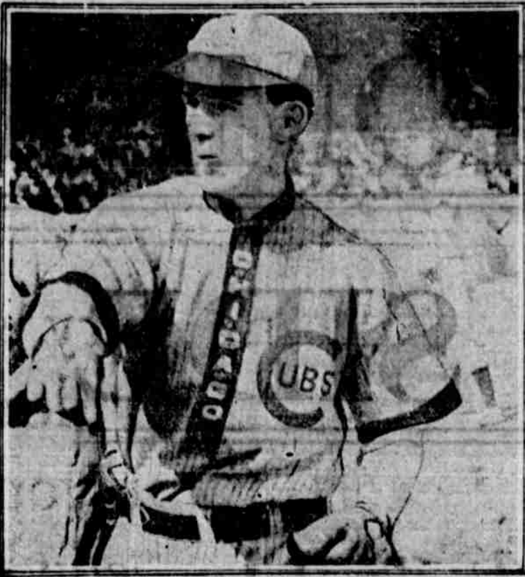
EVERS' CHICAGO SECOND BASEMAN He is playing in great form this year with Frank Chance's Chicago tribe "Johnny" is in the same form which made him famous two years back, and he will no doubt be a great help to the Cubs in their fight for the pennant.