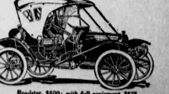
Roadster, $800; with full equipment, $875

Even if you don't expect to buy a car today, drop in at our local dealer's and have him give you a demonstration. It will incur no obligation on your part and it will give you an opportunity to see what wonderful work the cars will do.