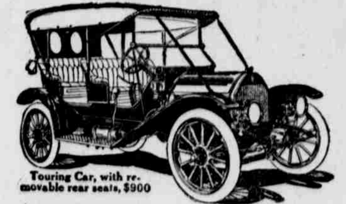
Touring Car, with removable rear seats, $900

The business you did not get last month because you did not have a car might pay for a Paige-Detroit. Just a few months' doctor bills of some families would pay for it. Suppose you charge off 20% per year for depreciation—it's still a good investment. You can come and go as you please—the Paige-Detroit is equal to any emergency. It's simple—easy to drive—will handle well in crowded traffic—is an ideal car to get about with—takes up little room in a garage—rides very comfortably—does not tilt sideways—has more H. P. per pound of weight than even the most expensive cars—it hardly ever gets out of order—tire expense is very little—car will run 250 miles on one tank of gasoline. It's a high grade light car, which is in a class by itself. We had no competition at the New York and Chicago shows. The fact that we have twice increased our making orders and have shipped cars to practically every State in the Union, as well as large orders abroad, furnishes some indication of the popularity and success of Paige-Detroit cars. There is no other car which has the amount of reserve strength—simplicity—efficiency—wonderful hill climbing ability—low weight.