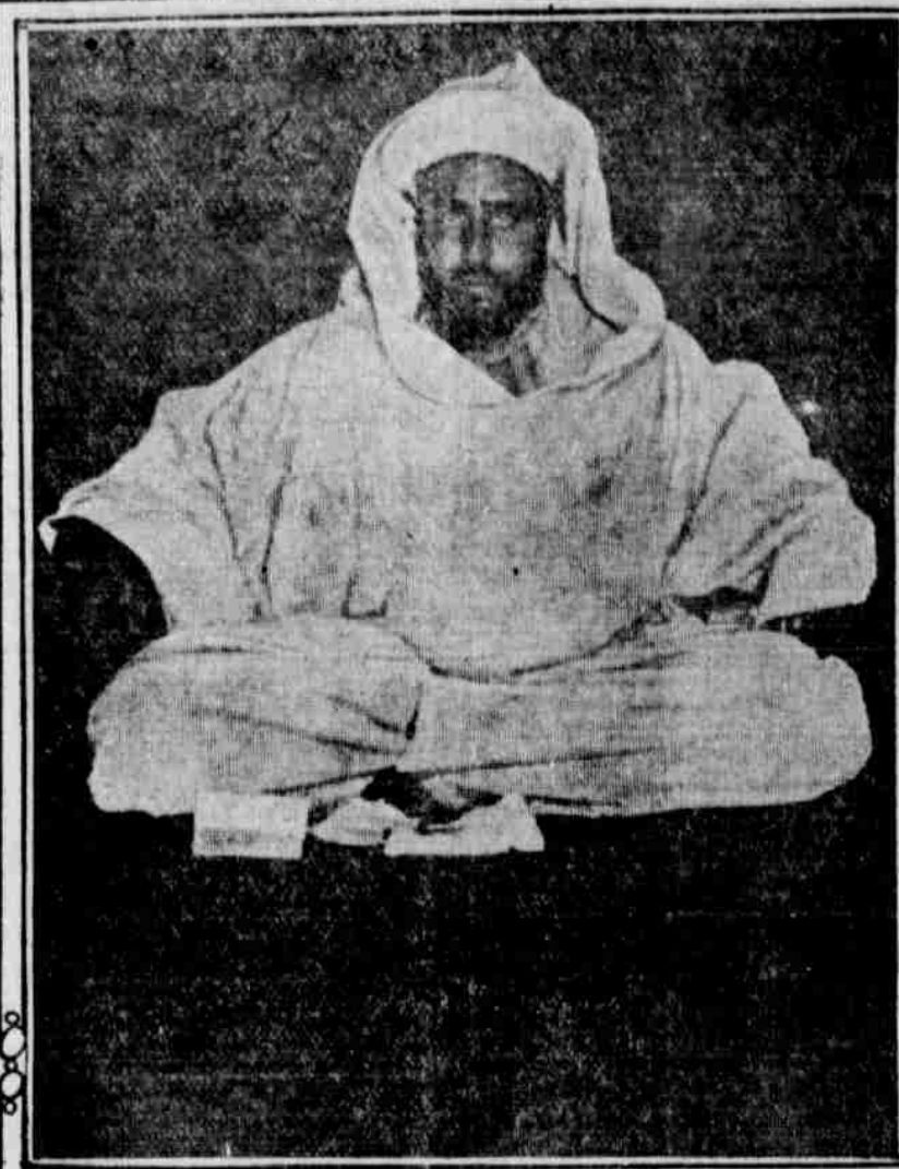
MULAI-ABD-EL-HAFID SULTAN OF MOROCCO