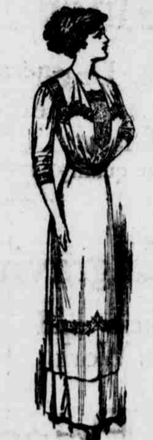
McCall Patterns No. 3631—Waist No. 3799—Ski A CHARMING FROCK