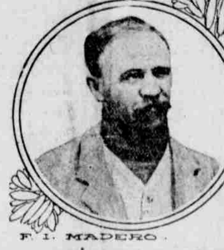
F. I. MADERO