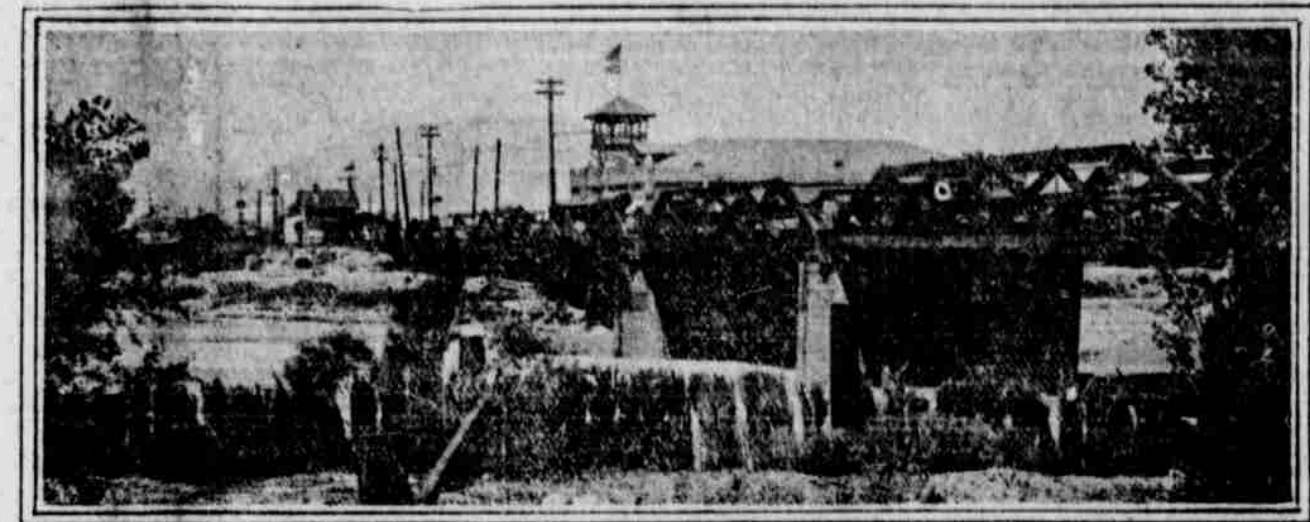
INTERNATIONAL BRIDGE BETWEEN EL PASO, TEXAS AND JUAREZ, MEXICO