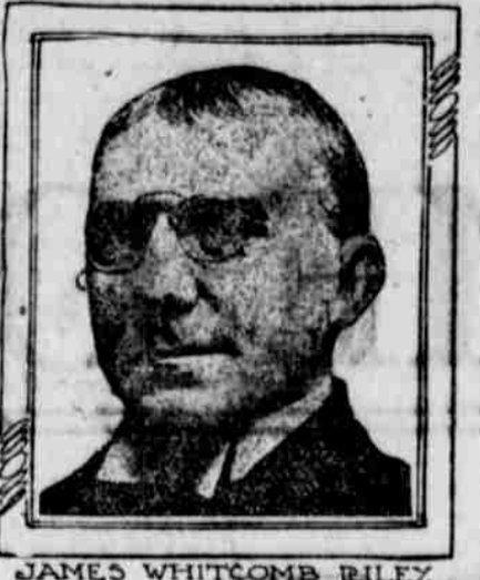
JAMES WHITCOMB RILEY.

Noted Hoosier poet, who has lost control of his hands and cannot walk without support.