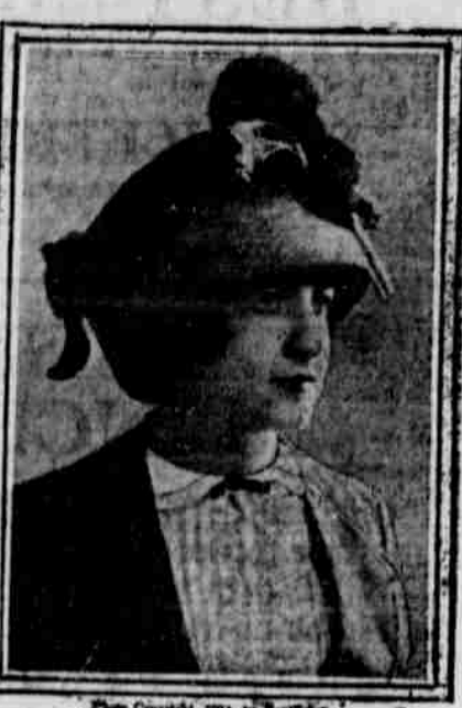
Cerise straw hat with black velvet.