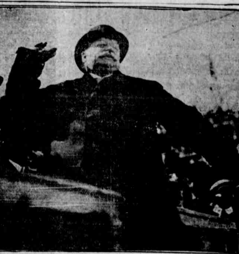
PRESIDENT TAFT THROWING THE FIRST BALL.

President Taft's annual baseball engagement is to toss the sphere into the air at the opening of the season at Washington.