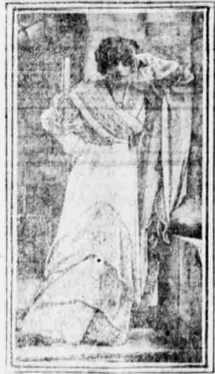
Champagne color silk and velvet evening wrap—Maison Martinet.