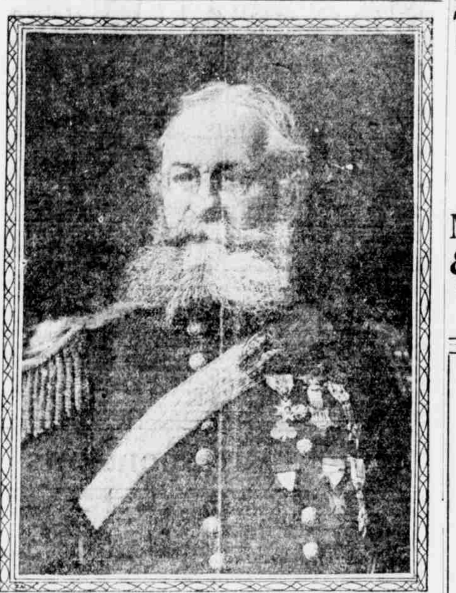
GENERAL A. W. GREELY, U. S. A., military aid to John Hays Hammond, special ambassador to the coronation of King George. General Grant, who was first named, is said to have expressed the desire to be relieved.