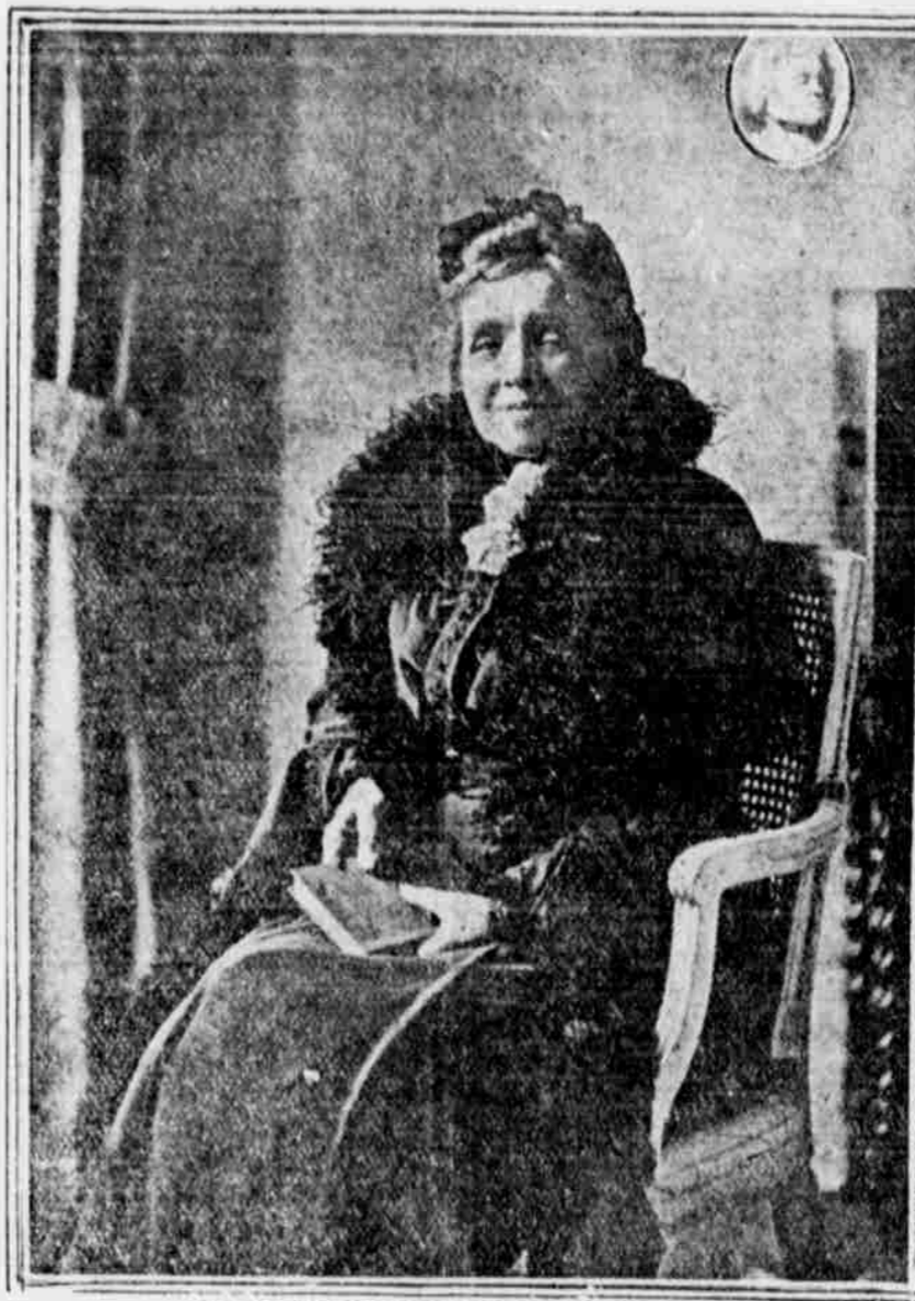
LADY RITCHIE, DAUGHTER OF THACKERAY.

William Makepeace Thackeray was born on July 18, 1811, and in July of this year many a glass will be raised to the memory of the author of "Vanity Fair." His daughter, Anne Isabella Thackeray, who married her cousin, Mr. Richard Thackeray Ritchie, in 1877, and is now known as Lady Ritchie, is one of the most distinguished of living woman writers. Her "Village on the Cliff" and "Old Kensington" are exceptional novels, and she is also known as a critic and biographer.