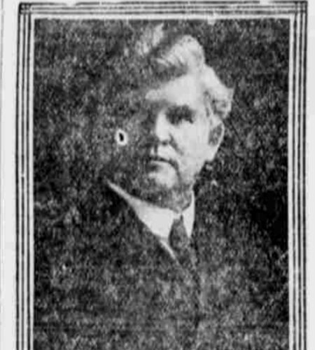
HENRY T. RAINEY. This is the democratic representative from Illinois who introduced a resolution in the house for the investigation of the action of Theodore Roosevelt in obtaining possession of the Isthmus of Panama for the United States.