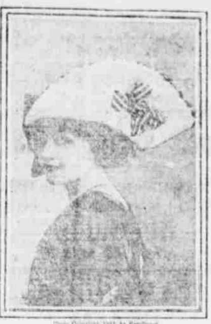
Black straw hat with more facing and black and white striped bows.