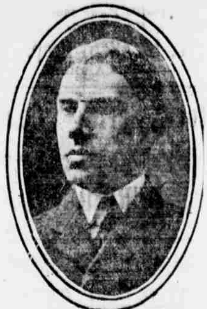
DR. JOHN H. FINLEY

NEW YORK, April 11.—It is currently reported here today that Dr. John H. Finley will be called to the presidency of Princeton university. He is one of the ablest executive educators in the United States today.