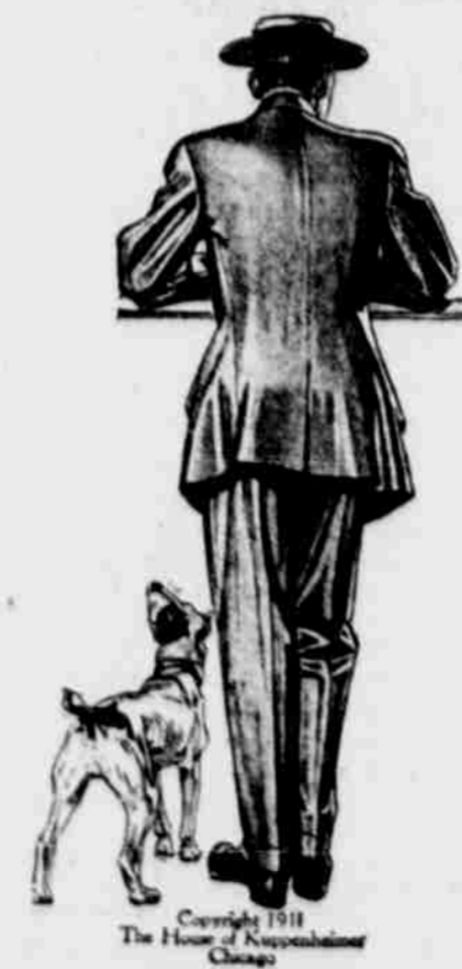
Copyright 1911 The House of Kuppenheim Chicago

Our line of Trunks, Bags, Suit Cases and Grips must be seen to be appreciated. Give us a look.