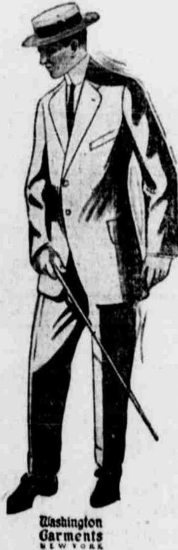
Washington Garments NEW YORK

pears and peaches; very slightly knoll; $5000. 15 acres very choice soil 1-2 mile from Phoenix; $200 per acre. 5 acres adjoining Medford city limits on west, $2500. 40 acres, very best soil near Central Point; 20 acres fine 3 year old trees; 10 acres wheat; good buildings; slightly place; $400 per acre. 10 or 20 acres choice garden land 1 mile from Central Point; $300 per acre; good terms can be had on all this property if desired. J. W. DRESSLER AGENCY, 101 West Main St. 307*