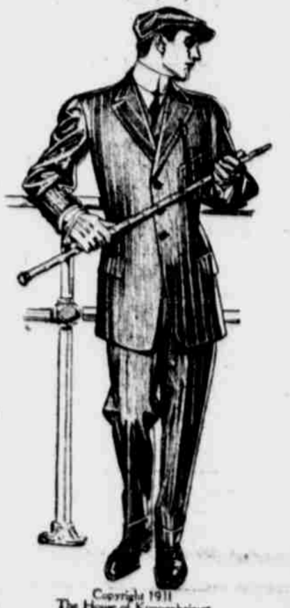
Copyright 1911 The House of Kuppenheim Chicago

with only a Golden Rule price on them. See the new Knp. fit Pants.