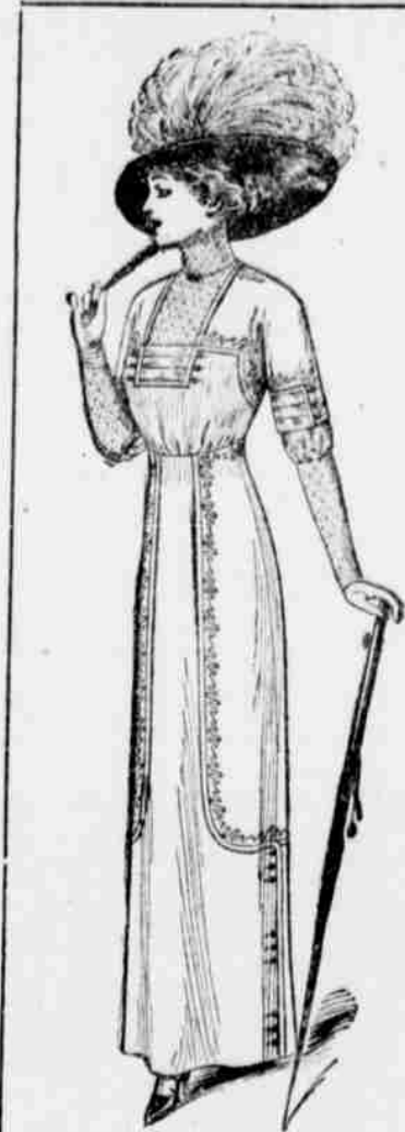
McCall Patterns No. 3867—Waist. No. 3879—Skirt Price, 15 cents each A SMART FROCK