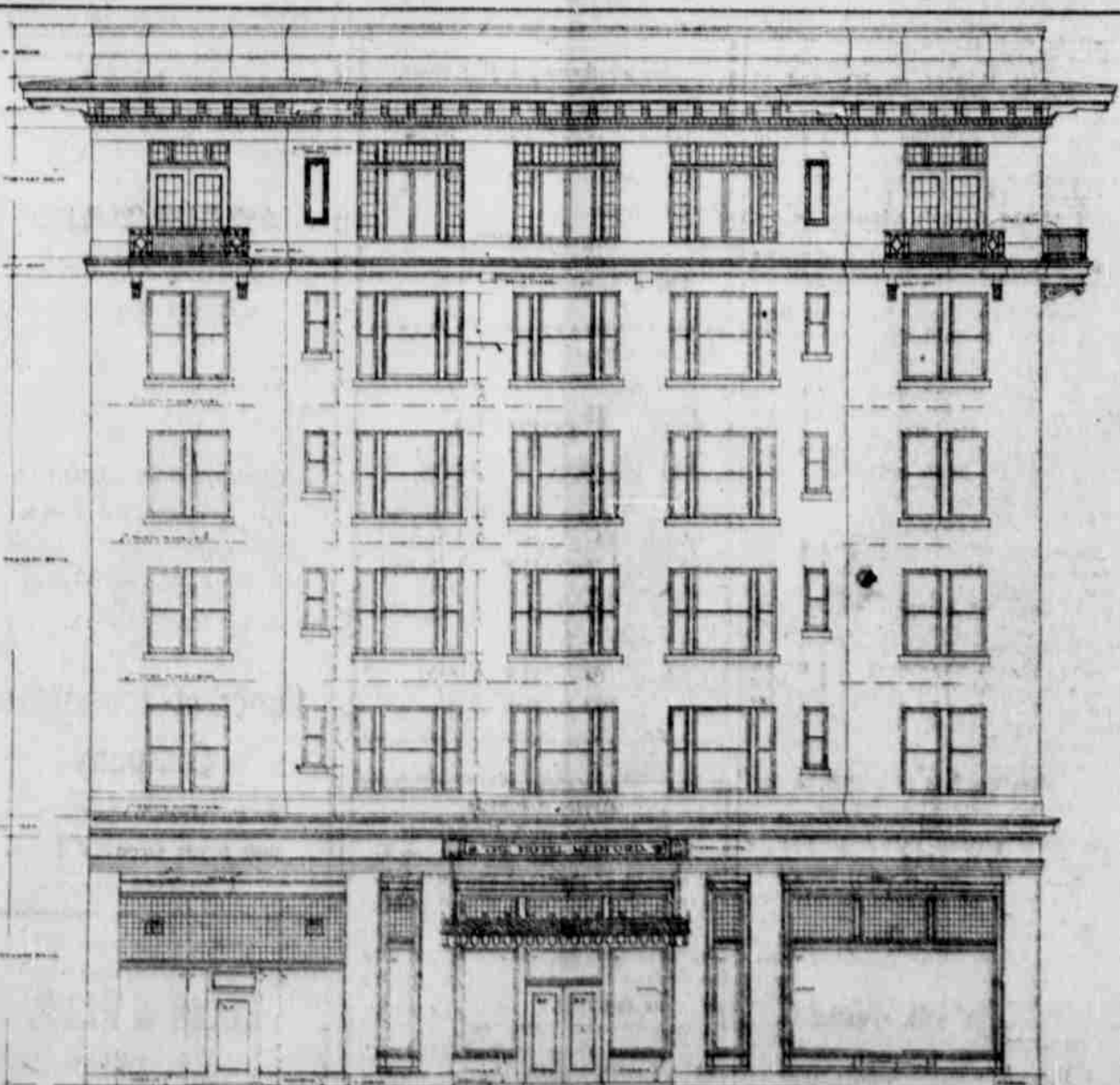
THE FRONT ELEVATION OF THE HOTEL MEDFORD WORK ON THE ERECTION OF WHICH WILL START EARLY IN THE NEW YEAR AND WHICH WILL BE RUSHED TO COMPLETION.