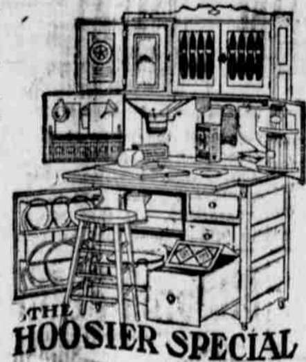
THE HOOSIER SPECIAL

You save steps and time. Your work is done quickly. Put this dining car service in your home this Christmas, with a Hoosier Kitchen Cabinet.