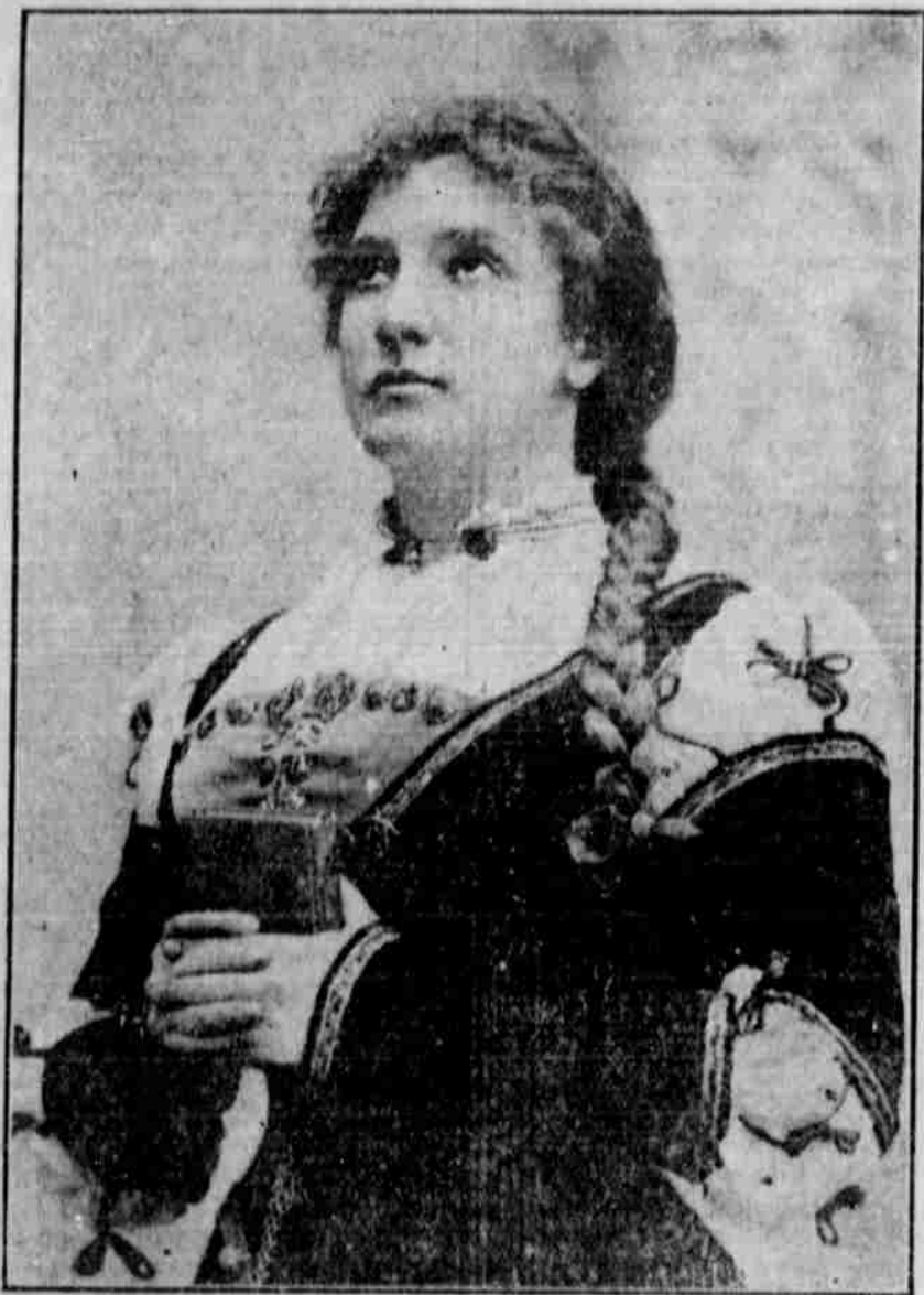
Mrs. Nellie Melba, once the peer of all songsters, after an absence on the concert stage of two years is going to make her farewell tour of the United States. Mrs. Melba has enough money to retire now, but answering the request of her many friends has promised one more tour. There have been many reports that age has marred the wonderful Melba voice. But's farewell tour, it will be recalled, was one of sorrow, for her musical powers had bowed before age.