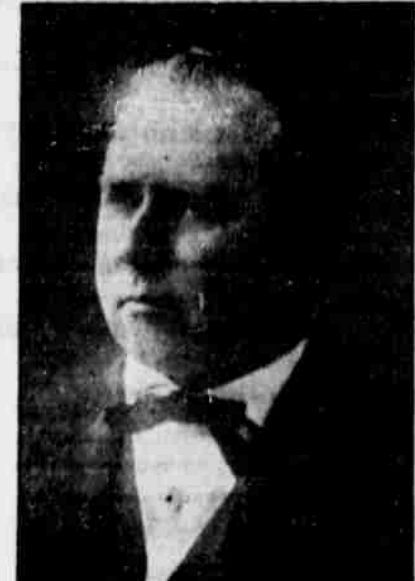
JUDGE WILL R. KING

Justice of the Supreme Court. Candidate for re-election for six-year term, whose plans are sought by George H. Burnett, the republican assembly nominee.