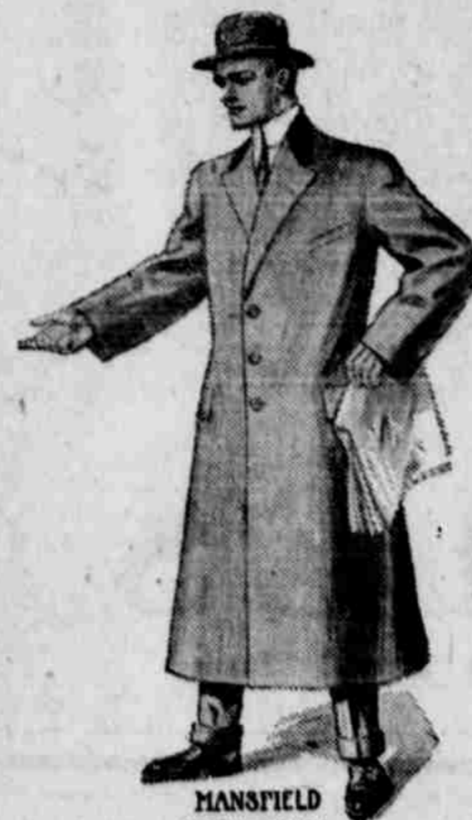
MANSFIELD COPYRIGHT 1910 BY THE LSYSTEM

We are prepared for your fall Underwear wants, both in union and two-piece suits in every grade and weight adapted to this climate. A look will satisfy you our prices are right on any garment you want.