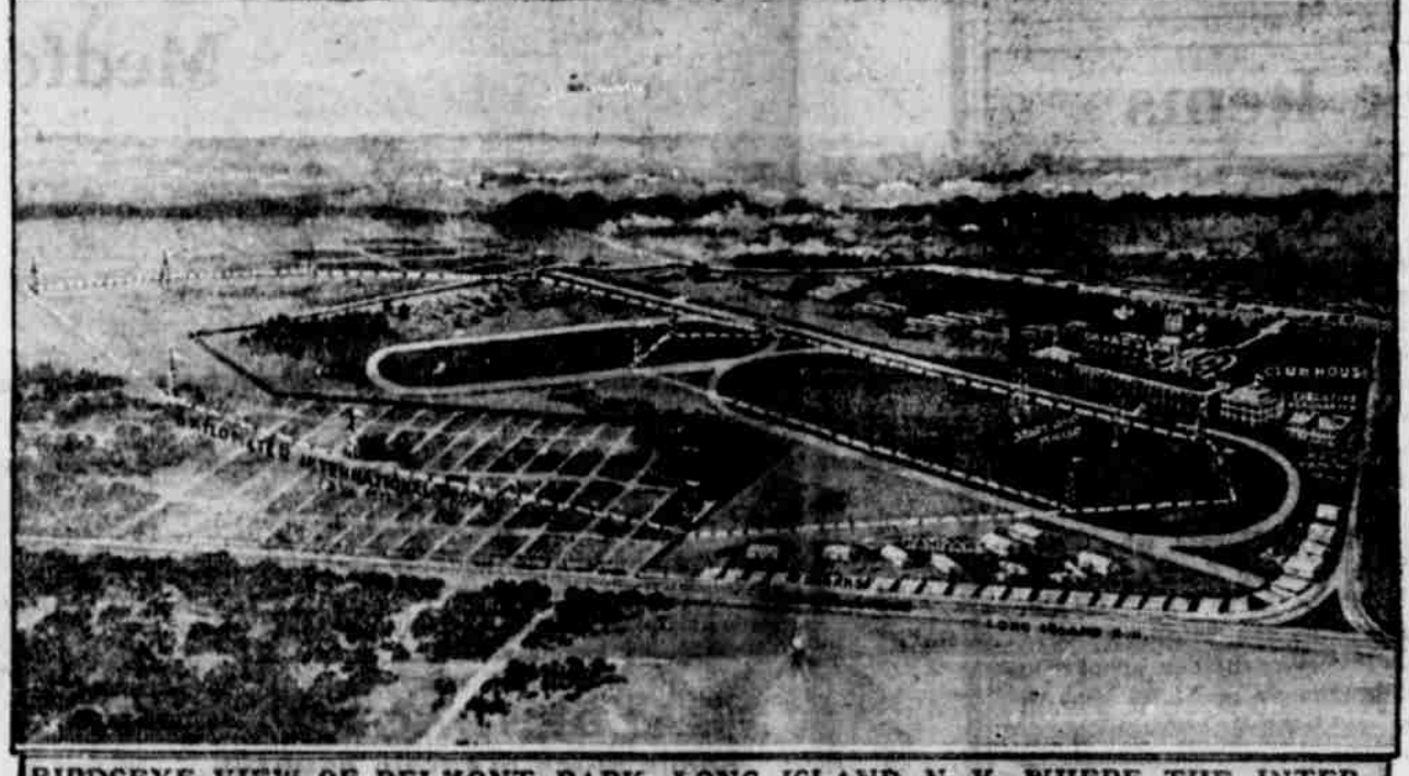
BIRDSEYE VIEW OF BELMONT PARK, LONG ISLAND, N. Y., WHERE THE INTERNATIONAL AVIATION TOURNAMENT WILL TAKE PLACE, OCT. 22 TO 30.

BELMONT PARK, N. Y., Oct. 25.—The new Wright racer, on which is set America's hopes in the international race for speed next Saturday, was the sensation of the aviation meet on Belmont field today. Although little larger than a whitehead torpedo, it bore Orville Wright around the course twice at better than a mile a minute, and at that was held under restraint.