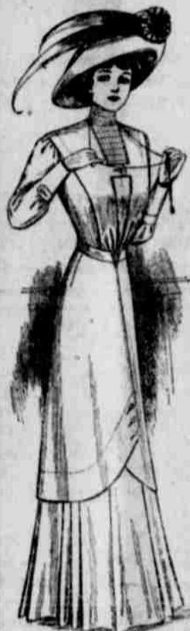
McCall Pattern No. 3233 NEW SPRING TOILETTE

ASHLAND, Ore., Sept. 24.—The event of the season from an amateur theatrical point of view is "Old Maid's Convention" pulled off