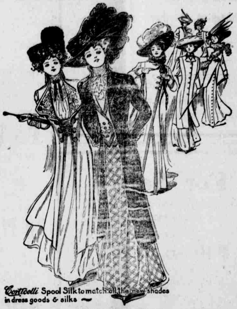
Centelli Spool Silk to match all the new shades in dress goods & silks

UMBRELLAS. Largest assortment in the city to select from; every one guaranteed; prices ..... 75c to $7.50