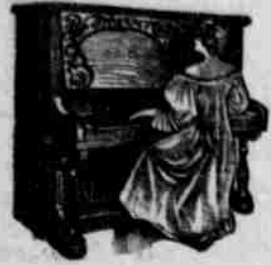
$400 Packard Piano, Purchased by the Mail Tribune from Sherman Clay & Company.

To The Ladies of Medford & Surrounding Country