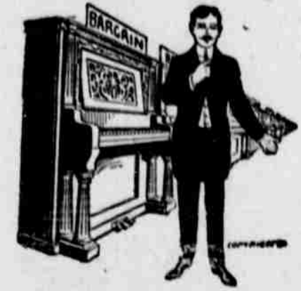
$400 Cable & Nelson Piano Purchased by the Mail Tribune from Hale's Piano House.