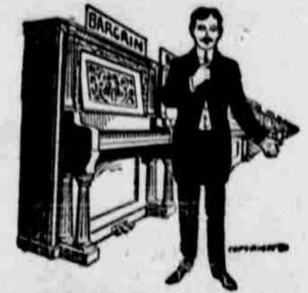
$400 Cable & Nelson Piano Purchased by the Mail Tribune from Hale's Piano House.