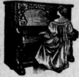
$400 Packard Piano, Purchased by the Mail Tribune from Sherman Clay & Company.