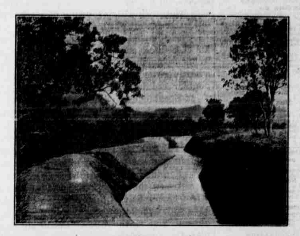
Completed Section of New Cenal

THE ROGUE RIVER VALLEY GAS COMPANY expect to be ready to serve GAS October first, and therefore ask that all those who intend to use gas will call at the Company's Office and make arrangements to have their house service connections put in AT