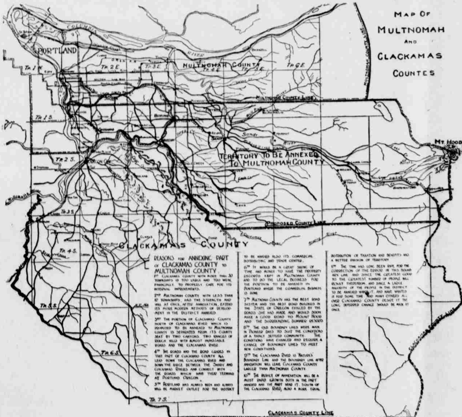
MAP OF MULTNOMAH AND CLACKAMAS COUNTIES

REASONS FOR ANNEXING PART OF CLACKAMAS COUNTY TO MULTNOMAH COUNTY