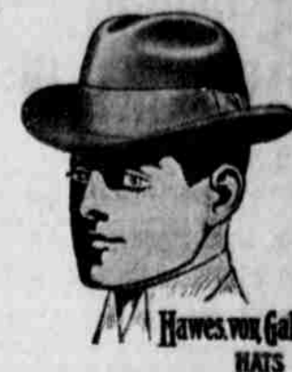
Fall Styles $3.00

The new Fall Clothing is here. Needless to tell you about the superior qualities of Hart, Schaffner & Marx Clothing, for most men know of them already. We simply invite you to call and inspect the finest selection of clothing ever offered by this store and at the price you wish to pay.