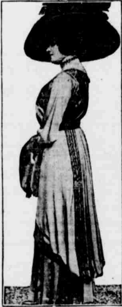
EARS AS THE FRESHWOMAN WEARS THEM.

The Latest Idea in Fashionism is to Conceal the Auricular Orifice. Artists both ancient and modern have always considered the ears as unsightly members of the human anatomy.