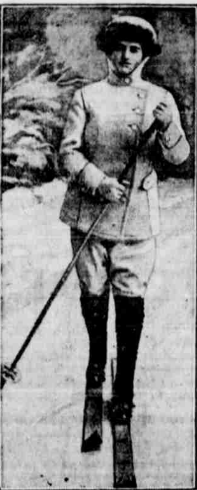
WHEN SHE GOES SKIING.

The Fascination of Skiing. In Norway skiing is a means of getting about as well as a fine sport during a great part of the year. And in our own country where the weather conditions are propitious smart society