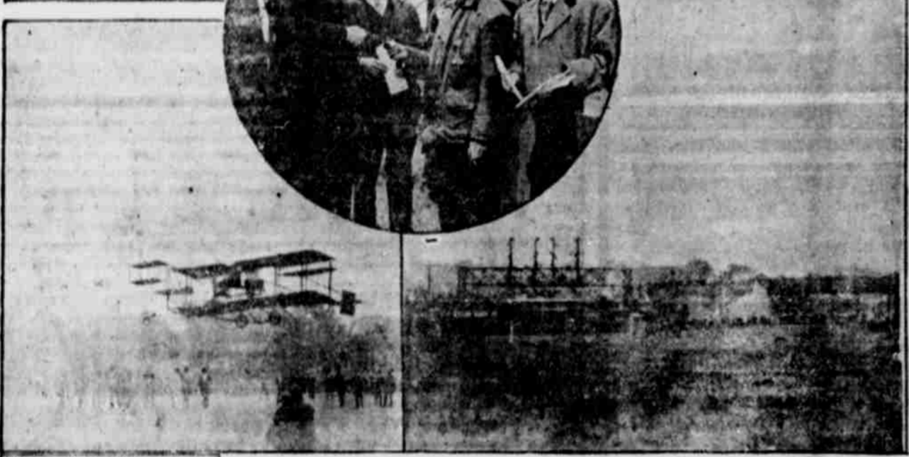
These pictures were taken during C. K. Hamilton's flight from New York to Philadelphia and return, maybe the most remarkable effort of any aviator. Hamilton now becomes a strong factor in the racer between New York, Chicago and St. Louis.