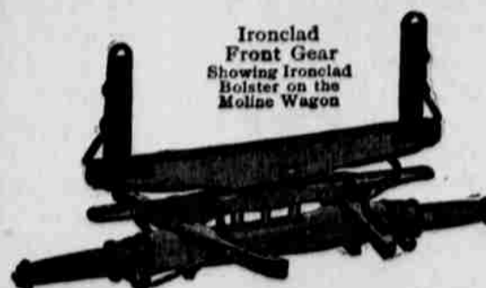
Ironclad Front Gear Showing Ironclad Bolster on the Moline Wagon