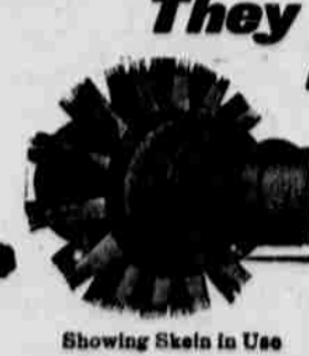
Showing Skels in Use