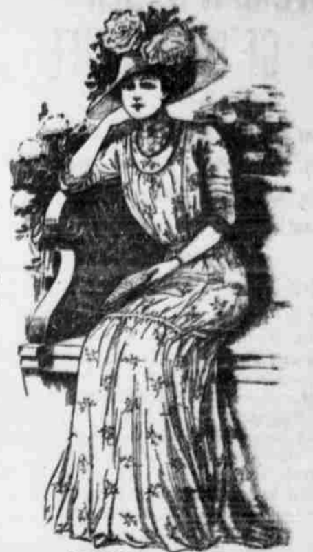
McCall Pattern No. 3398 DAINTY SUMMER GOWN