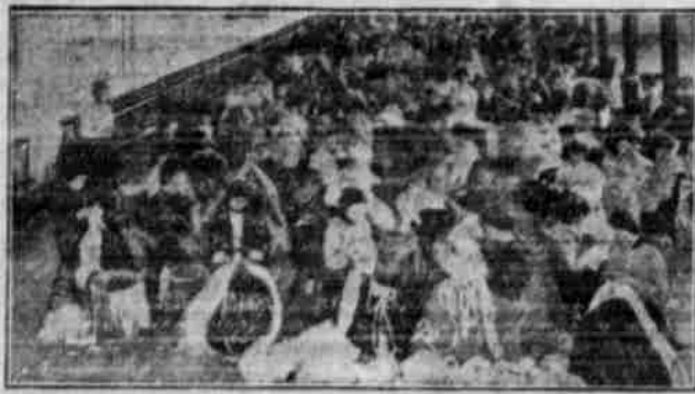
Separating, clipping and scalloping the web of laces.

and a display of illustrations of mechanical devices requisite in the art of fine lace making. This sale offers an exceptional opportunity for economy purchases of durable fine laces of ex- quisite beauty. It will prove very interesting even to those not intending to purchase. Zion Laces, manufactured in the most modern lace factory in the world, are the best of their kind made—the best wash laces ever placed before the American women—and sold without a cus- toms duty of 70% added to the cost, as are imported laces. All machines of Zion Lace Industries are and have been operating 18 hours daily, except Sunday, for over a year, with the product of each machine sold ahead several weeks. New machines are continually being installed. Women wanting laces for present or future use will experience a marked saving by visiting our lace counters.