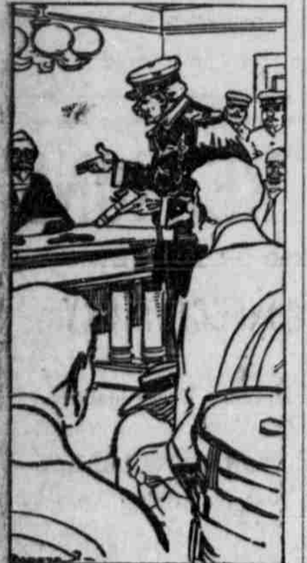
HE PRODUCED HOLSTER AND PISTOL AND LAID THEM BEFORE THE JUDGE.

sarcastic glance at Coquennil, "The old school has its good points, after all. Although I am no longer in charge of this case," rasped the fat man, "I suppose there is no objection to my rendering my distinguished associate," he bowed mockingly to M. Paul, "such assistance as is in my power. I happened to hear that this American has a room on the Rue Racine, and I just looked in there." "Ah!" said the judge, and Coquennil rubbed his glasses nervously. "Our friend lives at the Hotel des Bouchers, near the corner of the Boulevard St. Michel," went on Gibelin. "You examined his things?" "Four sur! I spent an hour there." "Well, well," broke in M. Paul, "what did you discover?" Gibelin lifted his pudgy hands deprecatingly. "For one thing I discovered a photograph of the woman who was in No. 6 with Martinez." "The devil!" cried Coquennil. "It is not of much importance, since already you have the woman's name and address." He shot a keen glance at his rival. M. Paul was silent. What humiliation was this! "How do you know it is the woman's photograph?" questioned the judge.