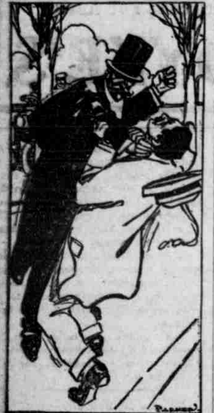
WHEN TRAINED FINGERS SOUGHT THE PAINFUL PRESSURE POINTS.

"We know the important things, too—all that concerns you from your forced resignation two years ago down to your talk yesterday with the girl at Notre Dame. We know exactly the moment when you are weak and un-