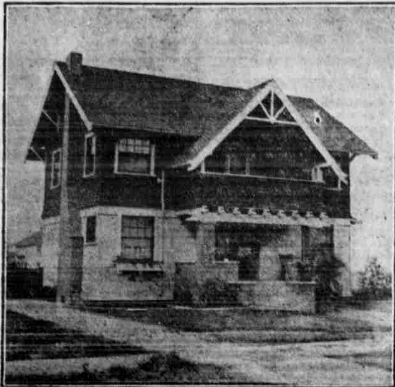
PERSPECTIVE VIEW—FROM A PHOTOGRAPH.

Design 865, by Glenn L. Saxton, Architect.