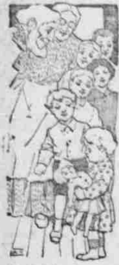
"I DES I'S NOT DOT NUFFIN."

And why not? To be sure, the nearest land is ten miles away, and when the winter storms come the waves dash quite over the two acres of rocks out of which the sturdy lighthouse rises. There are no blazing rows of streets lined with toyshops there, no gathering of families, no Christmas trees loaded down with presents, nothing to be seen from the lighthouse but the changing water and unchanging rocks—water on three sides and on the fourth side a bluff barrier of rocks, with the world hiding behind it ten miles away.