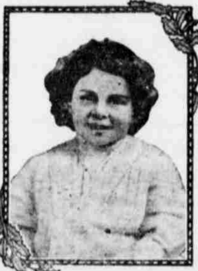
"DO YOU SUPPOSE THAT SANTA CLAUS WILL FIND US ON THE SEA?" On the good ship Polly the Christmas sun shone down

For ships must sail Though fierce the gale And loud the tempests blow.