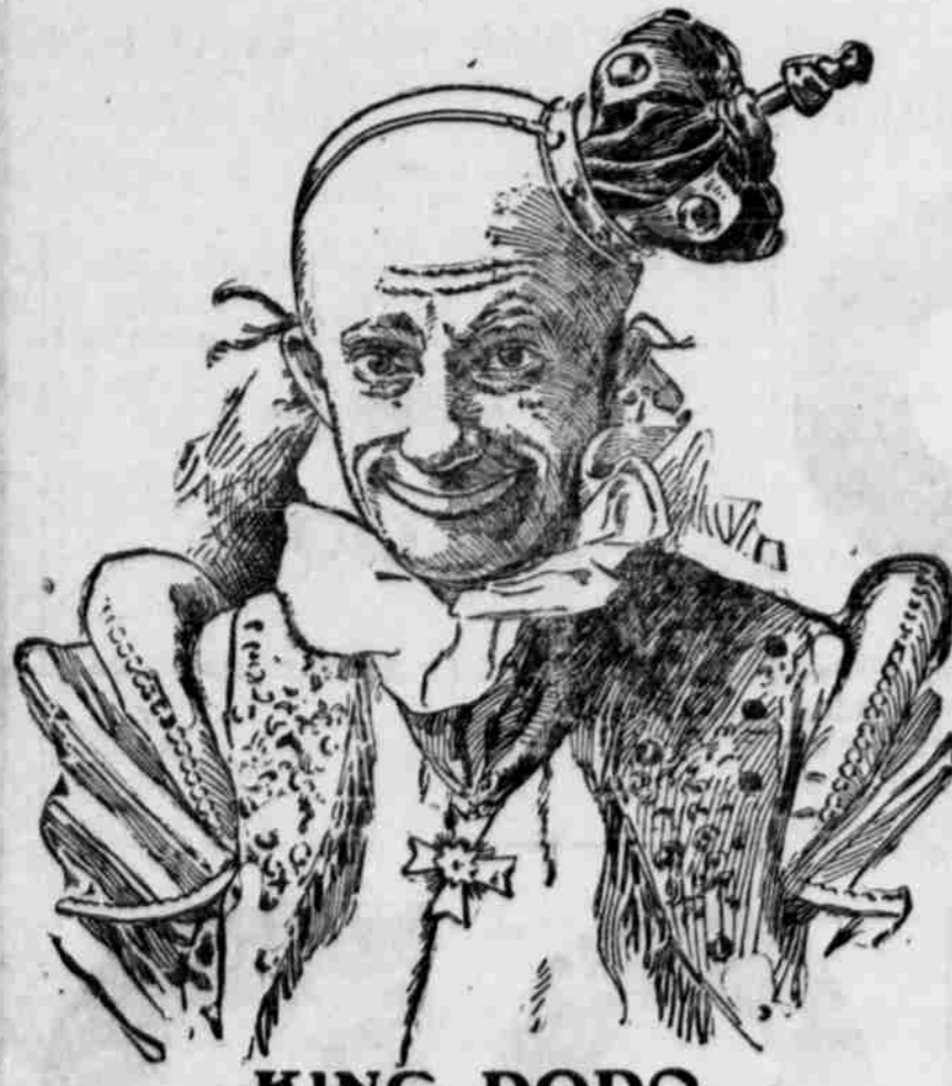
KING DODO Replying To Your Favor of the 11th