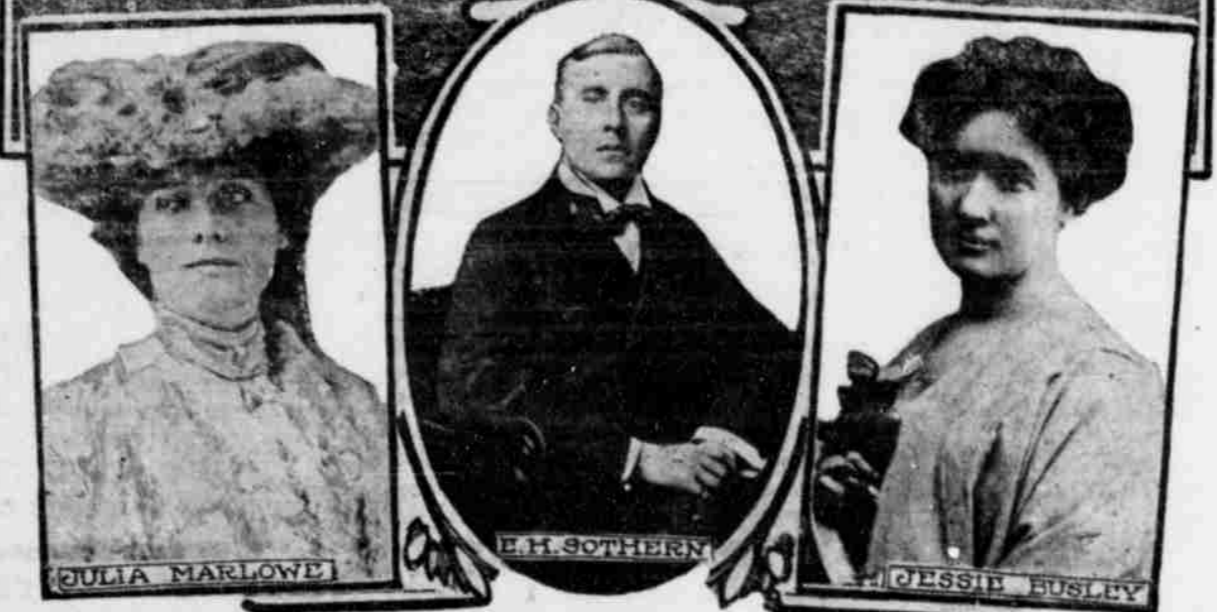
THE NEW THEATER, NEW YORK, AMERICA'S HOME OF HIGH ART IN THE DRAMA, AND THREE OF ITS STARS.