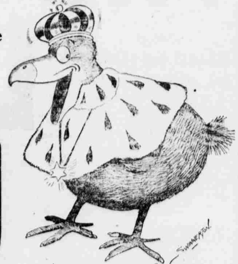
"ARE YOU WISE?"