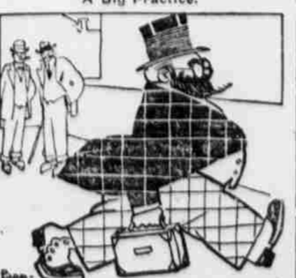
A Big Practice.

The Heiress in a rage—Leave my presence or I shall make you quail. The Duke (smiling)—I'm not particular about the quail, miss. I'd be satisfied with a ham sandwich.