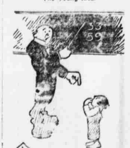
The Young Idea.

Teacher—Thirty-three was at 50 cents per dozen is what? Bill—Outrageous, I call it.