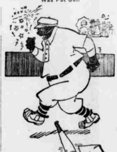
Was Put Out.

Grace—That player got angry when he hit three times at the ball and missed it. Frank—Yes; he dogs seem put out.