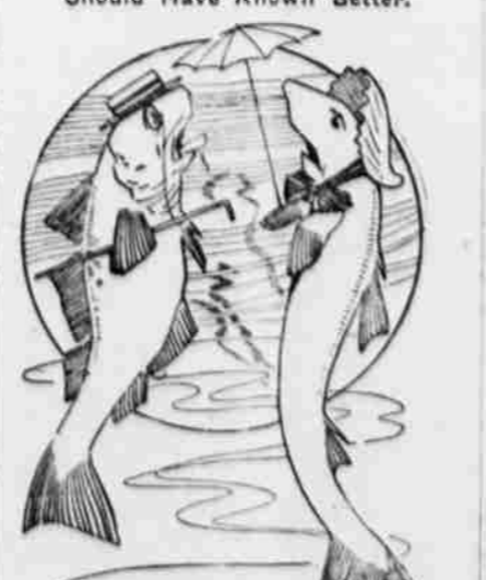
Should Have Known Better.

Miss Hippo—Mr. Monk is a multi-millionaire and the catch of the season. Why did you jilt him? Miss Giraffe—He seemed lacking in affection. He never even put his arm around my neck and kissed me once.