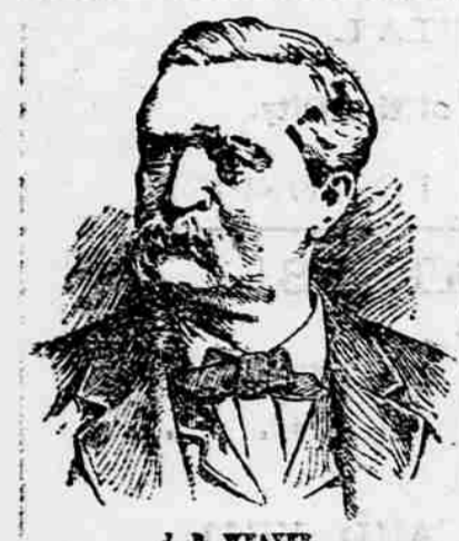
J. B. WEAVER.