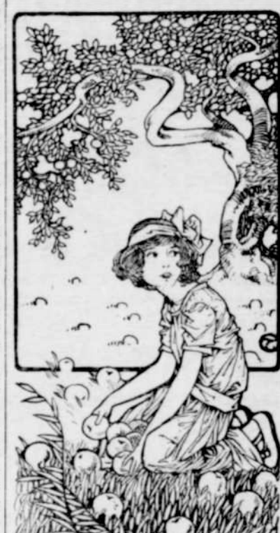
"I Got What I Could and Ran."

"I may as well tell you, I suppose—you'll have to know it sooner or later. She—went out into Avery's orchard and stole some apples this afternoon. I was back in the alley seeing if Mrs. Moon could do the washing; and I saw her from the other side. She went from tree to tree, and when she got through the fence she ran. There's no mistake about it—she confessed." The twins looked up in agony, but Prudence's face reassured them. Constance had told no tales. "I have told her she must spend all of her time upstairs alone for a week, taking her meals there, too. She will go to school, of course, but that is all. I want her to see the awfulness of it. I told her I didn't think we wanted to eat with a thief—just yet! I said we must get used to the idea of it first. She is heartbroken, but—I must make her see it!"