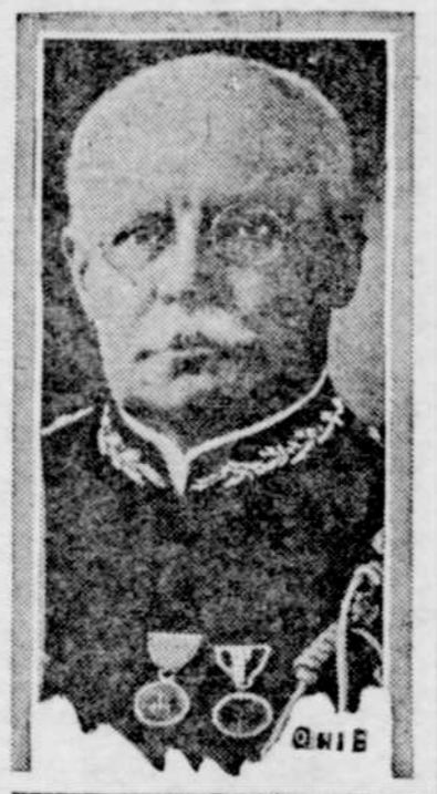
GEN. HUGH L. SCOTT

"If for no reason," the order continues, "there shall not be enough reservists or enough voluntary enlist-